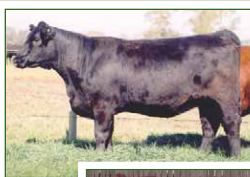
KBJ LASSIE 133M

Each lot consists of 3 embryos. Guaranteeing one pregnancy if done by accredited technician. FOB - place of storage