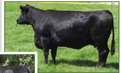
KBJ BLACK NANCE 608M AND KBJ BLACK NANCE 120T