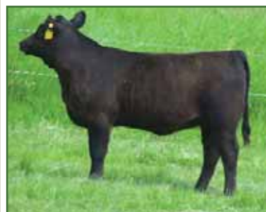
KBJ MISSIE 41M AND KBJ MISSIE 84T

BW: 91 lbs. SIRE: FRL ALBERDA TRAVELER 9P