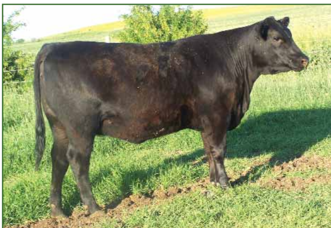
EVERBLACK CASSIE 28S

A Drylander heifer that will be easy to find and her dam happens to be one of our top producing cows. We purchased that Drylander bull not only because of his ease of fleshing and structural soundness, but because of his outstanding EXT mother who sold in the Dryland Anniversary Sale to Get-A-Long and Ringstead Ranch at top dollar. To quote the guy taking the pictures, "This heifer is flat-assed good"