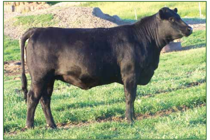
EVERBLACK ANDEE 12S

A stout, powerful heifer out of our good breeding Drylander bull. Drylander again had the top selling sire group at our Annual Bull Sale. His daughters are making really useful females; good uddered and easy fleshing. The dam is a Justamere cow that has produced very well for us. The old 186Z cow was a feature donor cow at Justamere.