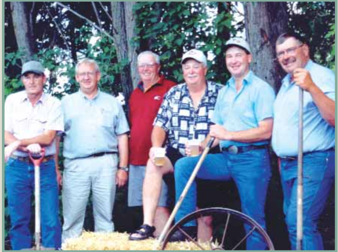
THE HAYSHAKER GROUP IN THEIR PRIME

SERVICE: Exposed from April 25 to July 8 to Lookout Pacer 48R