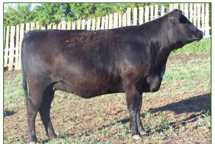
EVERBLACK ERICA KAY 24S