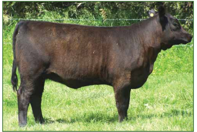
KBJ NEONIA 010T

A little different twist on paper for us at KBJ. We purchased a flush from Remital and this is one of the coupons they we have. This heifer calf is flat outstanding and might just be good enough to show at the World Angus Forum.