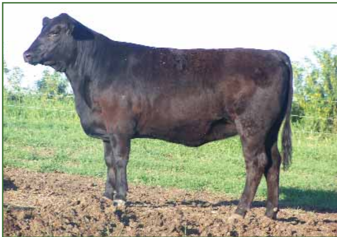
EVERBLACK TIBBIE 30S

A typical Drylander heifer; moderate framed and easy fleshing. The old 37D cow has been a marvelous producer for us sending sons thru our bull sale to Westman Farms, PFRA, South Cara Farms at Provost and Bob Wilson, all off of the top end. A daughter was out top selling female at Hayshaker 1999 to Devin Warrilow at Minburn Angus.