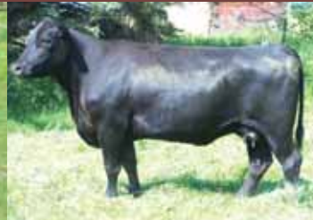
KBJ 113P - Lot 40