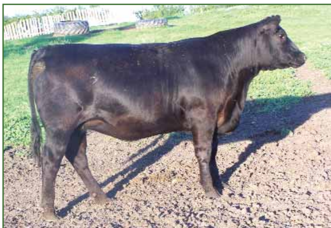
EVERBLACK MA BLACKBIRD 7S

Bought in dam out of the Back In Black With A Red Flair Sale, right from the top end. We have tried to gather up as many Masterplan 007 daughters as sales management would allow us. They make terrific females, good uddered and easy doing, but they are pricey. The Quantum 71N bull worked very well for us siring low birth weight cattle with good performance.