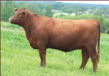
GEIS 16S - Lot 1

#407 4808 Ross St. Red Deer, Alberta T4N 1X5