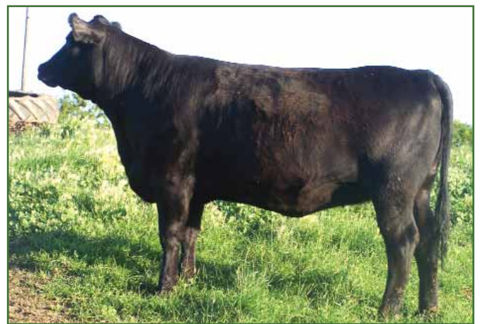
EVERBLACK KARAMA 36S