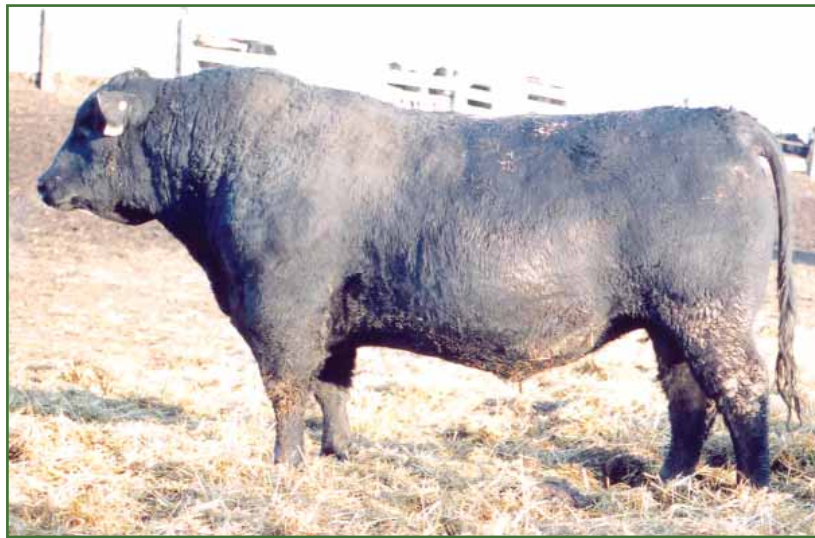
DRYLAND ALLIANCE 259 - SIRE OF MANY EVERBLACK LOTS

A package of these Drylander heifers would look good in any herd. That has been the Hayshaker success; it is where you get a chance to buy the good ones and have fun doing it.