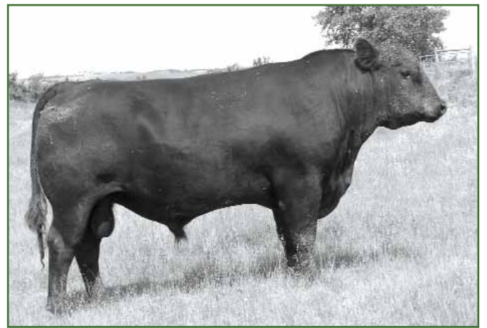
GEIS MAXIMUM 152'03 - SIRE OF JZT 27S

A nicely made, moderate framed daughter of Geis Max 152'03, who was selected from the Geis's for his muscle, structure, awesome look and his exceptional ribeye. On the bottom side is another outstanding Executive 10D daughter. They have sure worked well for us. Also note the Brookside 12U bull; a bull that really made his mark for the Ranchers Choice group.