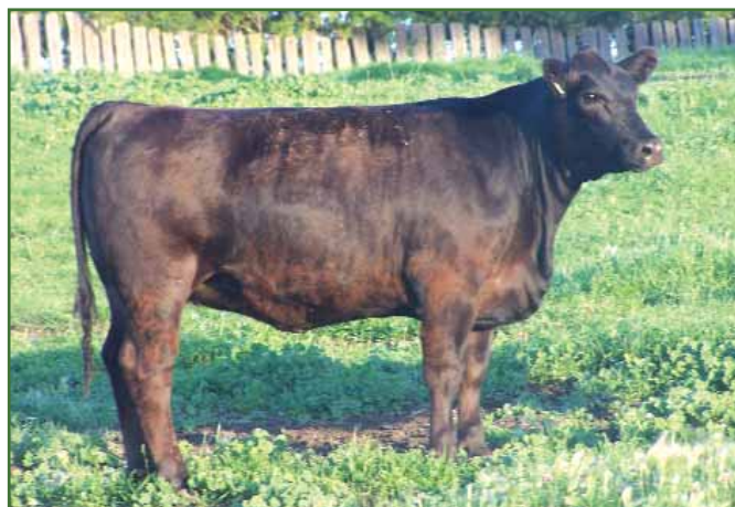
EVERBLACK ATALANTA 11S

A feminine, moderate framed Max daughter. Geis Maximum 152N was the $15,000 top selling bull at the Geis Bull Sale the day we bought him. He has worked well for us and we are still using him heavily. Atalanta 36N is just coming into her prime and is out of a great cow family. The granddam 52K has a son working at Minburn Angus, a son to PFRA and 3 daughters in herd.