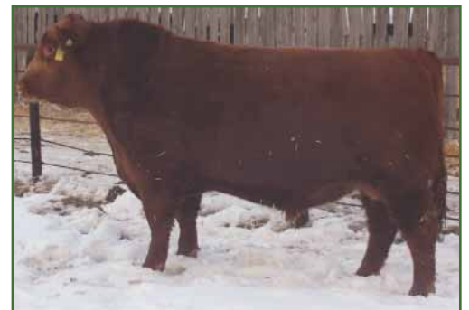
RED BCAR WILDCARD SIRE OF EMBRYO LOT 57A