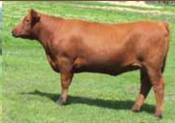
GAL 127S - Lot 24