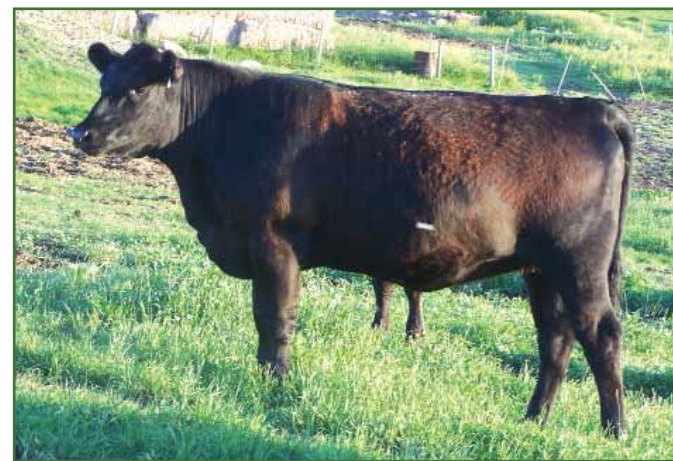
EVERBLACK LADY ANN 95S