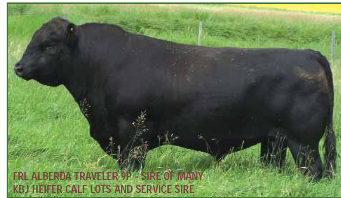
FRL ALBERDA TRAVELER 9P - SIRE OF MANY KBJ HEIFER CALF LOTS AND SERVICE SIRE

BW: 89 lbs. SIRE: REMITALL PARAMOUNT 150P