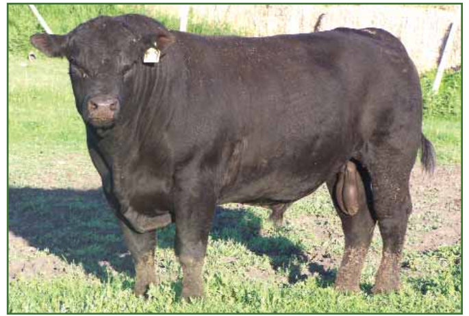
LOOKOUT PACER 48R SERVICE SIRE FOR ALL EVERBLACK BRED HEIFERS

An attractive, well made daughter of the $15,000 Geis Maximum bull. The dam, 30K, was purchased out of the very popular Superstar Sale right off the front end. She has produced very well for us; 2 daughters in herd and a daughter thru the very popular Masterpiece Sale to Border Butte Angus.