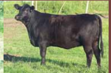
JZT 21S - Lot 61