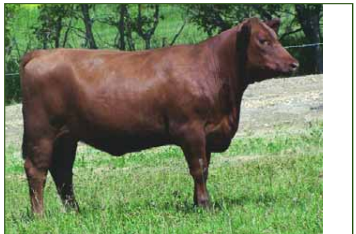
RED GET-A-LONG HIGHLIGHT 559

selling for $10500 to Swan Creek and Bogle Pass while her Century baby brought $3750 that same day. Because we had this Gold Medal daughter of Highlight 14H to act as her replacement, she was released for that particular sale. I've always said one can never ever have enough direct Patriot 16 daughters in your program!