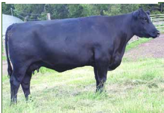
KBJ IDA 612M