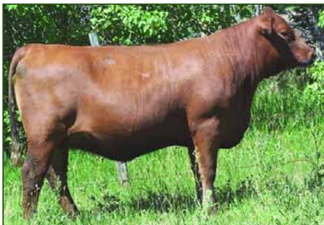
RED GET-A-LONG PENNY 5140

This year, our group of bred heifers, all red, are the evenest ever with an age range of about 7 weeks and once again we have tried to include a cross section of the Get A Long herd bull battery with 8 different sires represented in our group of ten. Our numbers of heifers this year was cut back because a group of twenty were sold to Mile High Land and Cattle Co of Red Deer plus our 10 in the 17th annual Spring Classic were very well received scattering to BC, Alberta, Saskatchewan and Ontario for an excellent average of $2825. When we sold Rainmaker in the 2003 All A.I.'d sale to Diamond D for $20,500, Red Bar M Rainmaker 82M (Deano) was his best son that we could find to fill the void, note his dam was one heck of a $9600 purchase by Bar M (first calf) where dam was Red Bonny 7468 (Brylor feature cow in 2004 at 14000 (1/2 interest) to Darcy McGhan. We have only released two daughters of Deano to date to Maple Acres and Dale Weins. He was injured this spring in a bull fight and came out second