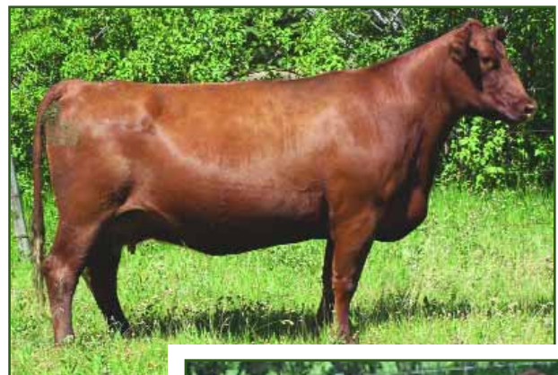
RED GET-A-LONG MISSIE 1128 AND RED GET-A-LONG MISSIE 6160

BW: 80 lbs. SIRE: RED CHOPPER K RESURRECTION 229