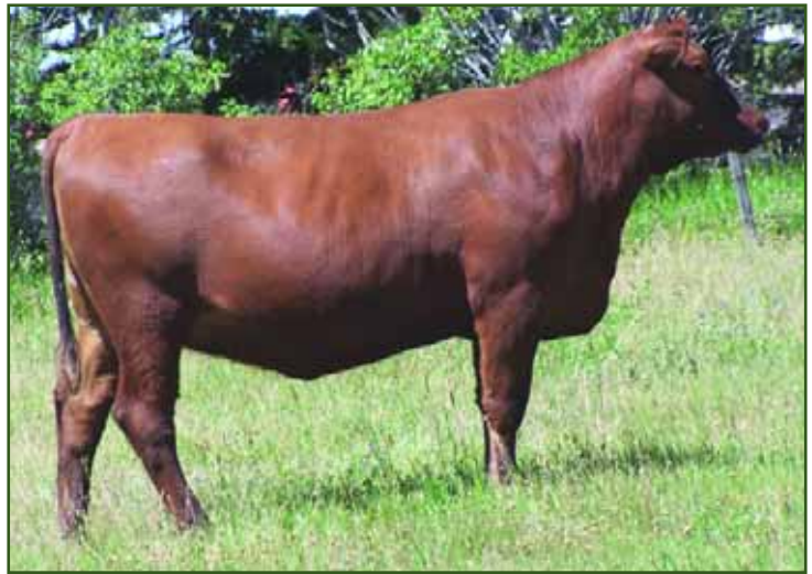
RED GET-A-LONG DUCHESS 5125