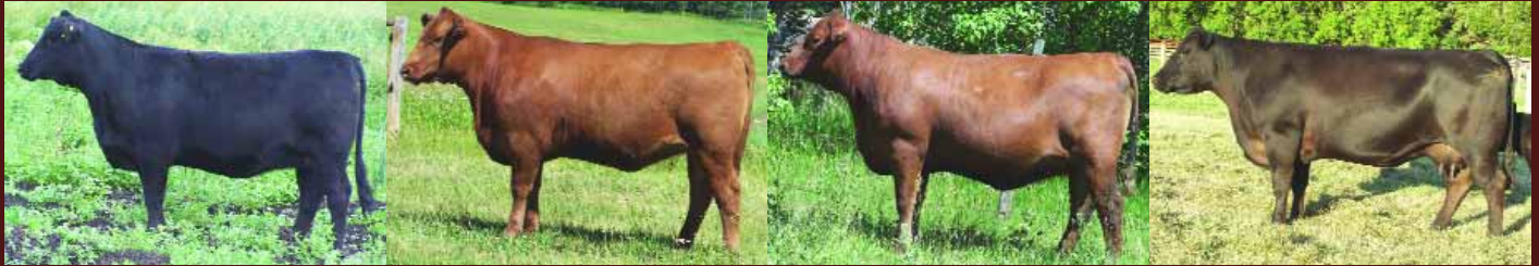
JYG 43R - Lot 7

Time Sensitive Material Deliver by July 23/06