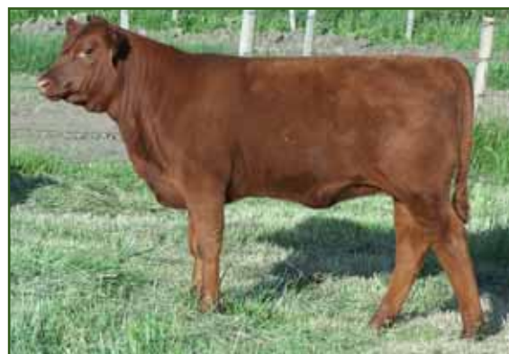
RED KBJ SLICK 998S