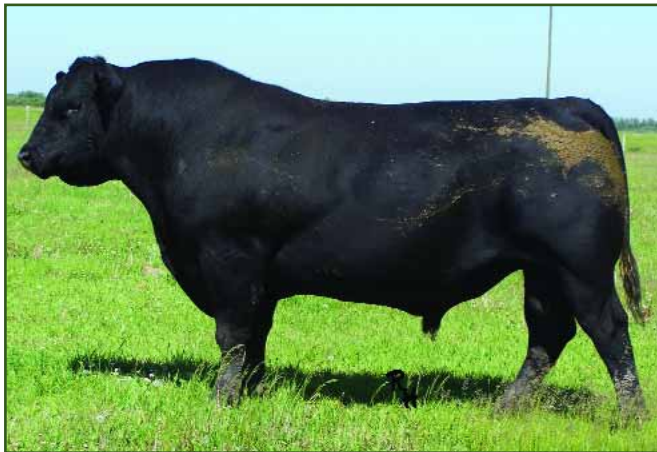
BAR E-L QUANTUM 124L - SIRE OF LOT 51A