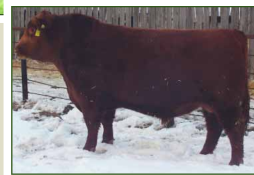
RED BCAR WILDCARD SIRE OF EMBRYO LOT 67

We were very fortunate to acquire Red Ron's Missie 15F privately. She has a perfect udder with very good teat placement, excellent feet and structure you would want in all of your cattle. She has had 5 bull calves, 4 to commercial herds and 1 bull; Red KBJ Rainmaker 963N which we have used heavily in our herd. The sire to the embryo lots is our new herdsire Red Minburn Windy 5178. He has turned heads from all visitors here and we will continue to feature him in our herd.