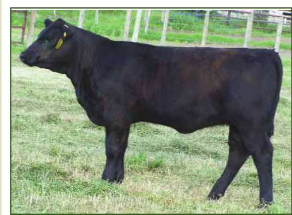
KBJ MARIA 140S