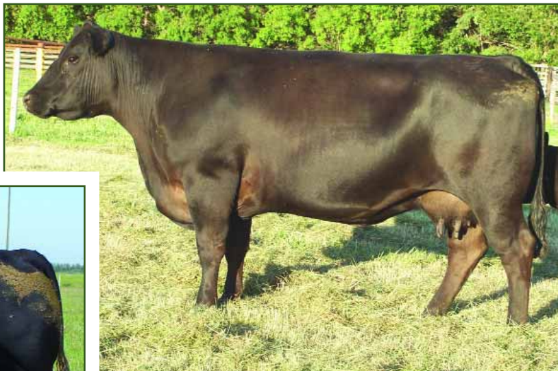
KBJ ANNIE 438K

We weren't able to catch a picture of this excellent heifer.....guess you will have to be at the Hayshaker to see what she looks like.