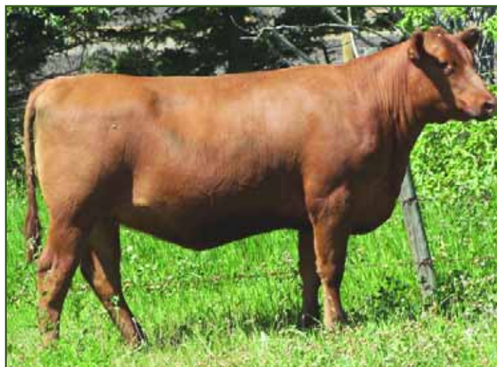
RED GET-A-LONG JOANNA 5133

I was asked the other day by a fellow Angus Breeder from Saskatchewan when we were towing the sales heifers, how can you keep selling all the good replacement heifers at Get A Long year after year in the Hayshaker, Red Roundup or Spring Classic and still maintain the herd status within the industry that you have. The answer is very simple. we do try to purchase many of the daughters or granddaughters of the individuals that we sell at the many sales we attend. No cow bred heifer or heifer calf is untouchable at Get A Long and the only females that are not priced are Shelly and our border collie, Ellie. Shelly might be negotiable with the right offer some days! This heifer is a maternal sister to last years high seller at Hayshaker 2005 at $6400 to Y Coulee, from Frenchman Butte, Saskatchewan. They are also our partners in the new $24900 outcross bred bull, Jester from Regina Bull Sale plus Hustle and Resurrection. That particular heifer was a Linebacker daughter whose paternal brother, Place Kick, was the pick of the 2005 Dare to be Different Bull Pen, The feature cow, we have in this event by