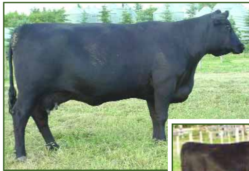
KBJ ATALANTA 58OK AND KBJ ATALANTA 692S

Another Jack Black heifer that is sure to look just like momma. The Overdrive cattle make awesome cows with their great udders, milk flow and fleshing ability.