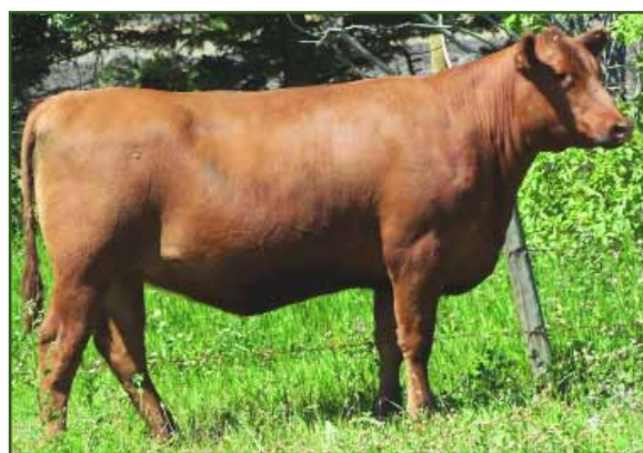
RED GET-A-LONG LASS 516