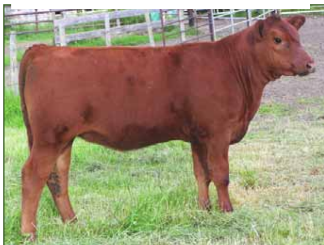
RED KBJ HEROINE 976S