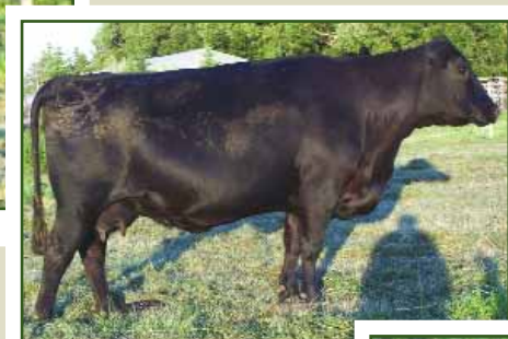
KBJ NANCE 336M