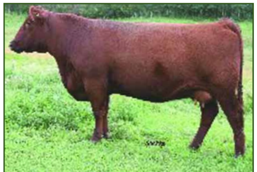
RED RON'S MISSIE 15F