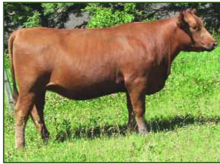
RED BROX FAYETTE 3R