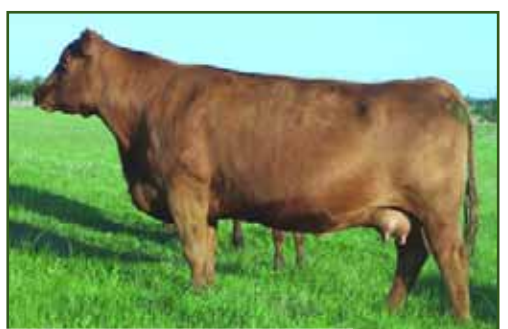
RED HIPS REBELLO 4N