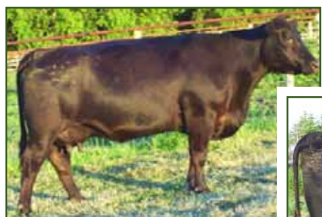
KBJ LUCINDA 433M