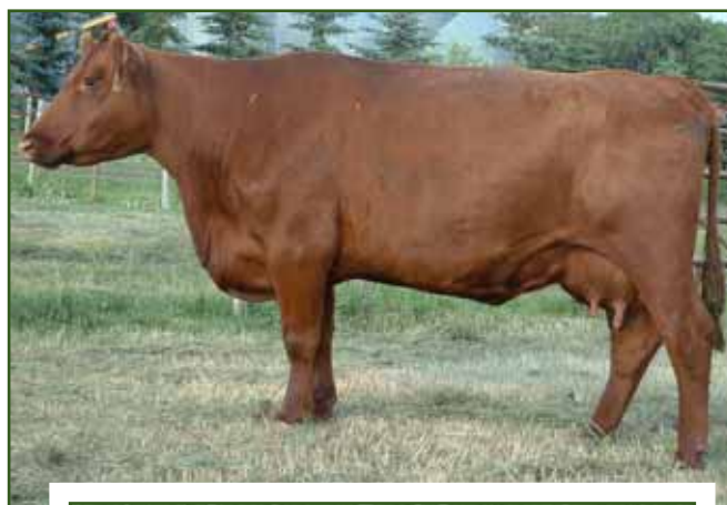
RED HIDDEN SLICK 801K

The only daughter of the $30,000 Wildcard bull in the 2006 Hayshaker. Wildcard has left us with a limited semen bank and nightmares of Helicopters and a set of calves are flat good! Muscular, stout, hair and a herdbull look! Look for some serious herdbull prospects from him this fall. Oh yea! The daughters are pretty flashy themselves, but come see for yourself!