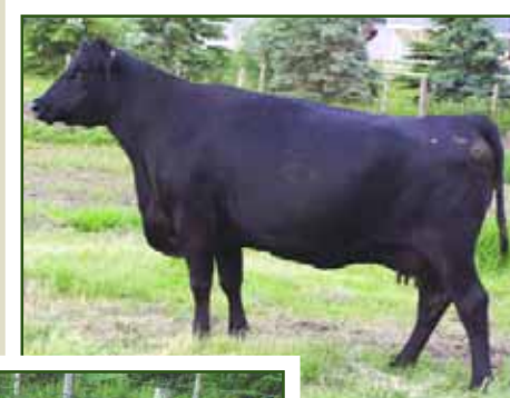
SPRUCE MEADOW JOLNE 139L