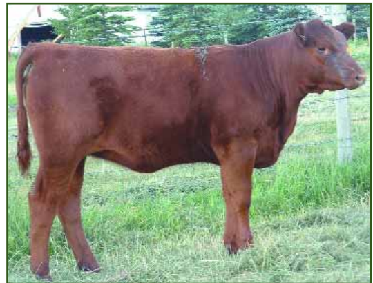
RED KBJ PRIDE 964S

These Rambler calves look very very good, bulls and heifers! Much like the other Rambler heifer in the sale, fancy and has a cow look to her, just what we wanted!