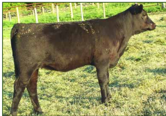
KBJ BLACK IDA 141S