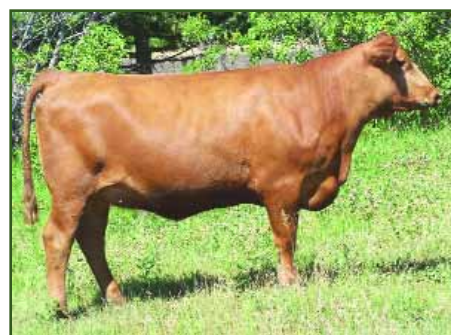
RED GET-A-LONG PRIDETA 561