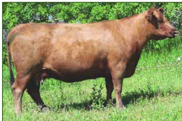
RED GET-A-LONG MISS SWEET 166