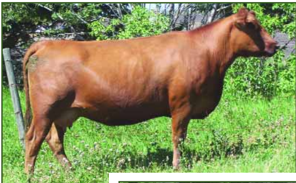
RED GET-A-LONG JOANNA 276 AND RED GET-A-LONG JOANNA 636

BW: 80 lbs. SIRE: RED GOLD-BAR MERCEDES K 116M