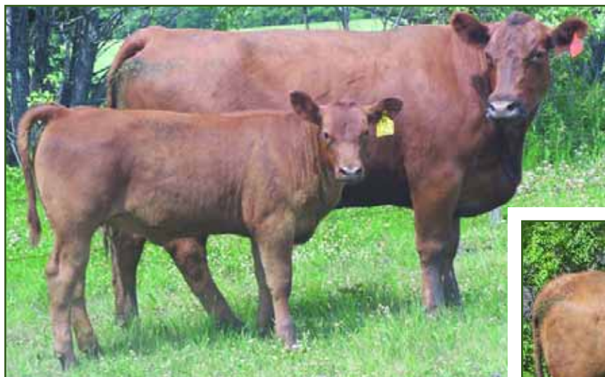
RED DIAMOND D LUPIN 253L AND RED GET-A-LONG BAYBERRY 699

Applied For • GAL 70S • Female • February 7 2006 BW: 85 lbs. SIRE: RED T-K BEYOND 306