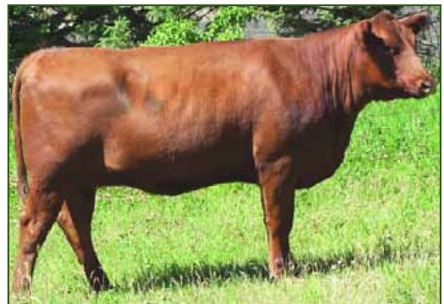
RED GET-A-LONG MRS YOUNG 501

The cow families that most breeders associate Get A Long with are the Soapys, the Mrs Youngs, the Ellies as well as the Carmellas. If the individuals that start the family are indeed superior, then the family name is highly saleable, plus very important in your cattle selection criteria. This has always been of major importance at Get A Long because good individuals with out a pedigree do not have near the value of others. Sometimes they cost more because of the genetics and the way they have been stacked. This heifer is a grand daughter of none other than Gold Medal who was owned jointly with BN Ranches at Boyle, Alberta. It is interesting to note that many of our top bulls sell to outstanding commercial herds that appreciate the effort involved in trying to produce them. Did you know that Linebacker was priced at $10000 to a commercial man and his selection was Little Joe, our top century son that year. Anyway, Gold Medal produced a $11400 daughter to Ringstead Ranch at Red Roundup 2001 that was also