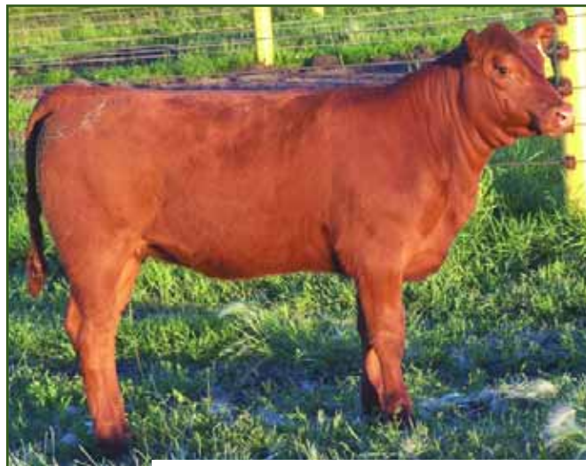
RED CRESCENT CREEK RAMBLER 70P - SIRE OF LOTS 65A & 66A