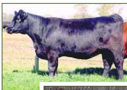
KBJ LASSIE 133M

Each lot consists of 3 embryos. Guaranteeing one pregnancy if done by accredited technician. FOB - place of storage