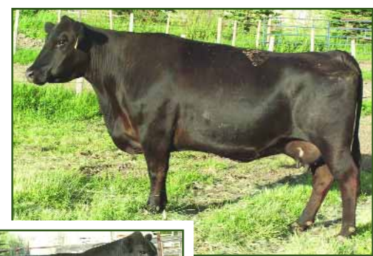
KBJ LARAMIE 675S AND KBJ LARAMIE 675S