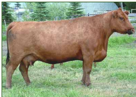
RED CLEEAR RIVER HEROINE 21J

To be fair you might want to keep the pair together as this heifer is a smoker. Thankfully she's not illegal to be in a public place. Deep red, sound structure, this heifer is easy to find!