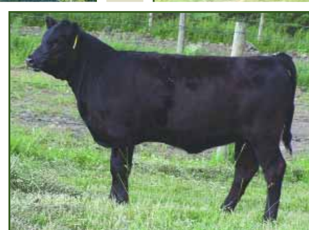
KBJ JOLENE 16S