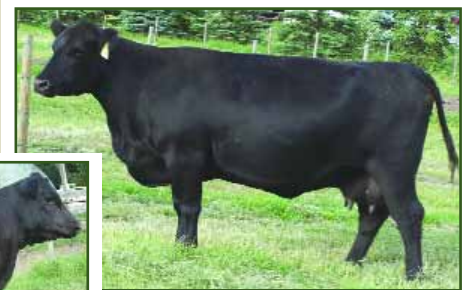
FISHER AVA 2J AND KBJ AVA 648S

These Max calves will intrigue you sale day!