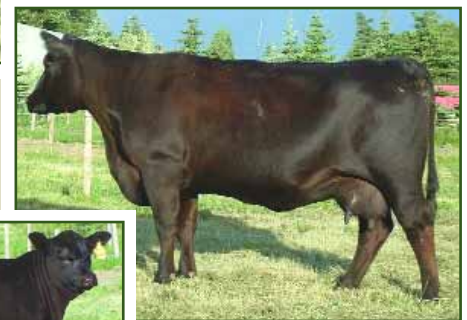
KBJ RUBY 521J AND KBJ RUBY 640S