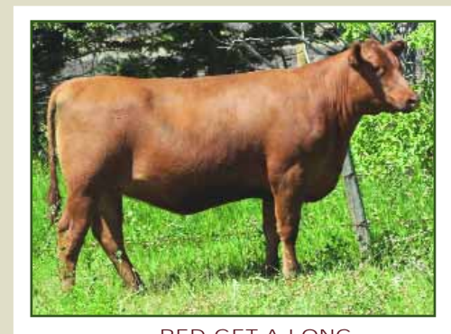
RED GET-A-LONG CARMELLA 553