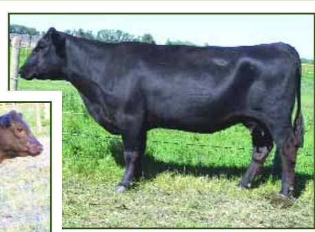
KBJ ATALANTA 572L AND KBJ ATALANTA 842S

LOT 56A Applied For • KBJ 842S • Female • January 20 2006 BW: 92 lbs. SIRE: DRYLAND MAX 389